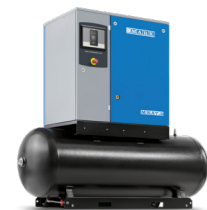
Tank Mounted version without dryer