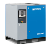
Floor Mounted version without integrated dryer